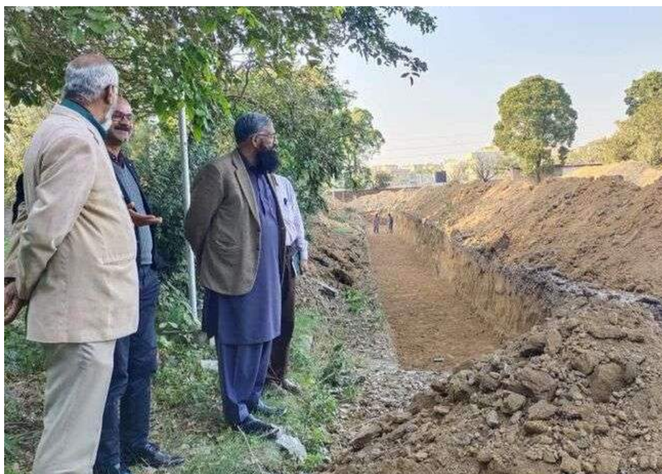
Installation of Tube well at Hajj Complex. Quetta